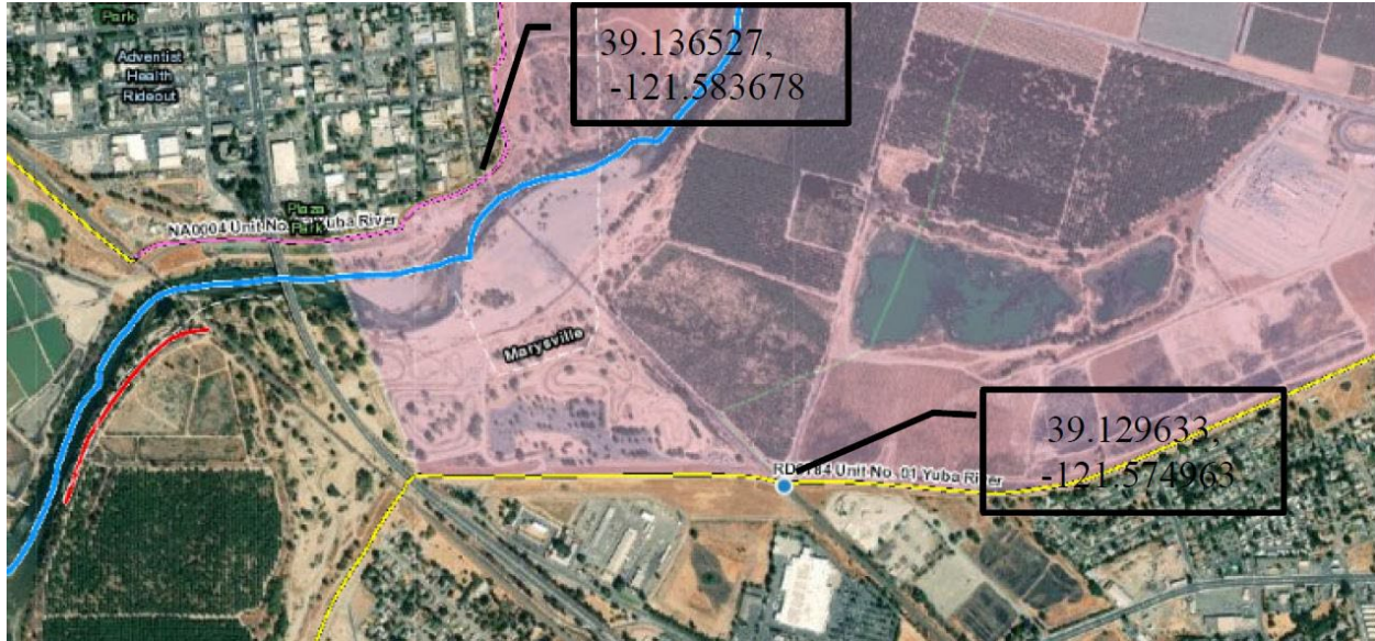
2) Location Map